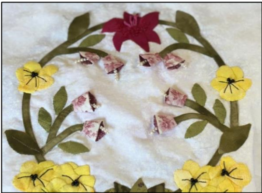
Close up of some of Ruth's current hand work.