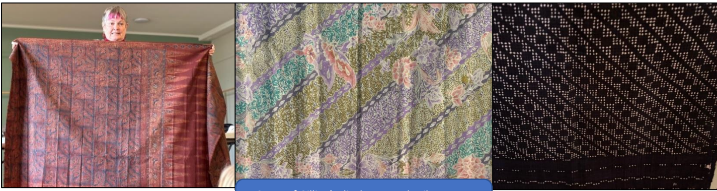
Some of Gillian's display. True batik sarongs are the same both sides.