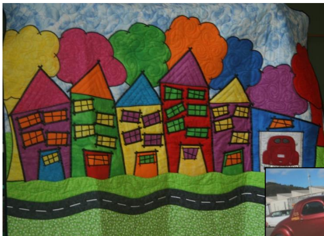
Alison T's - love the car parked in the garage? Photo on right is of her husband's hotrod.