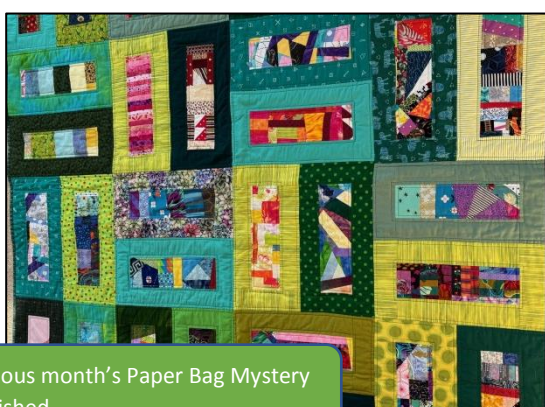
Two gift quilts ready – from a previous month's Paper Bag Mystery Block finished.