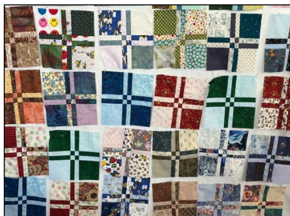
Some of the many blocks handed in at the September meeting. Should be enough for two quilts.

Alison unfortunately cannot make the September meeting but Prue will be on hand to receive any projects coming in and will have a couple more project packs ready to hand out. Please have a chat with Prue if you'd like something to take home to work on.