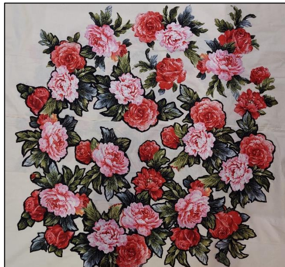
One of the donated floral applique pieces that has been started (top right corner) and needs finishing.

Similarly, if you'd like to check out the applique, get in touch.